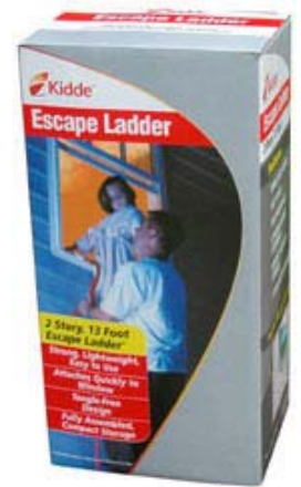
Kidde Fire Escape Ladder

If giving or attending a Holiday Party, make sure there are designated drivers available of people who are not drinking to drive other guests home, drinking and driving is a dangerous combination.