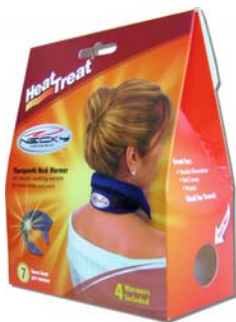
Heat Treat Neck Warmer

First Aid Kits and CPR kits ... Plus Much More!