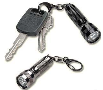
Key Mate Flashlight

Be Safe Plus LLC promotes and encourages safety practices and provides a one stop shopping opportunity to purchase a wide variety of safety items. Our new products division seeks out fresh and exciting items to keep you and your family safe.