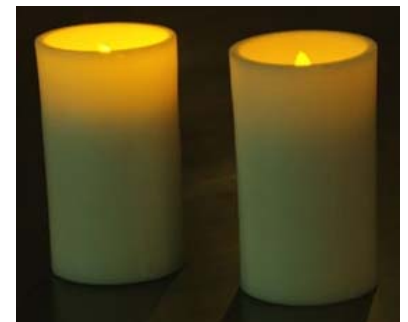
Flameless Pillar Candles