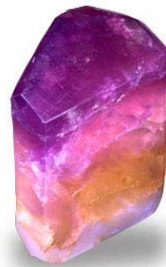
Amethyst Soap Rock